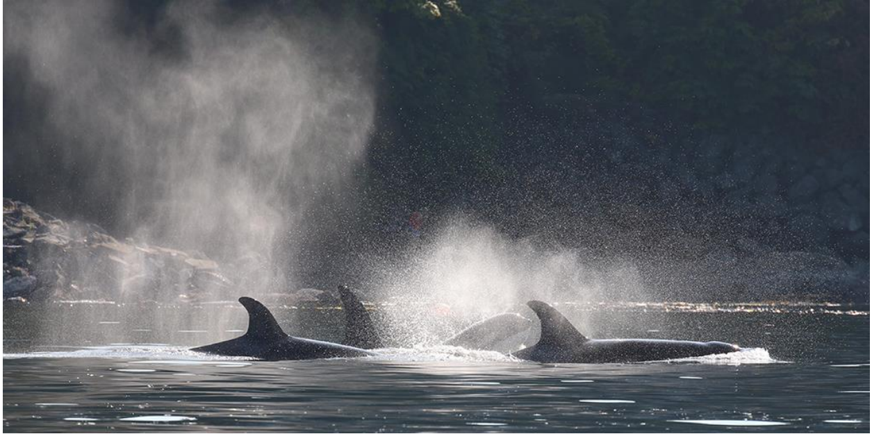
Mist shrouds a group of transient, or Bigg's, orcas.