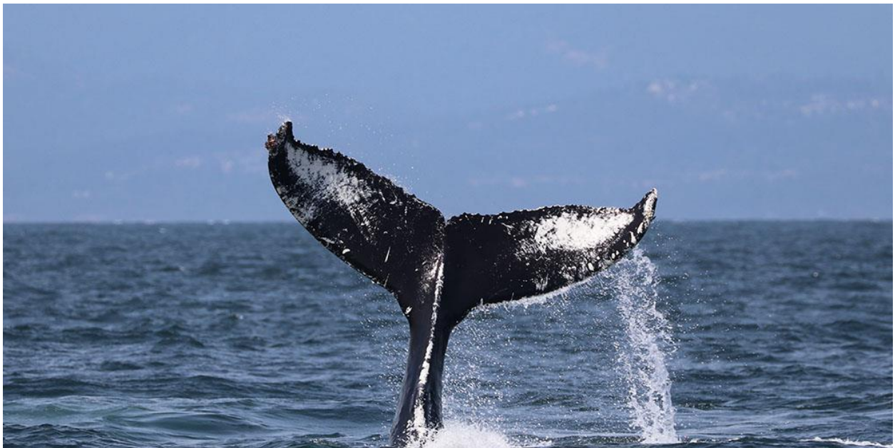
A humpback whale's tail flashes as it dives underwater.