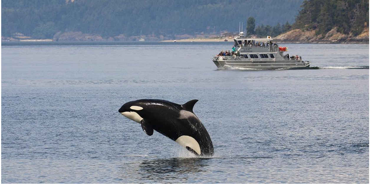
An orca jumps from the water in front of a whale watching boat.