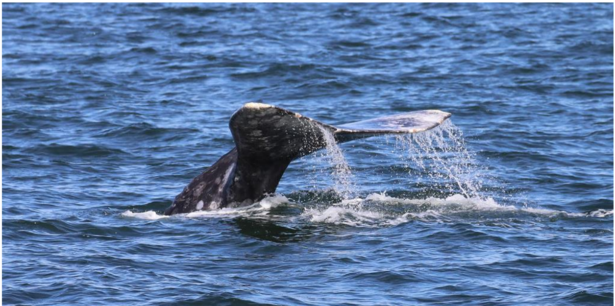
During the few tours Island Adventures was able to run in early March, gray whales were seen in area waters.