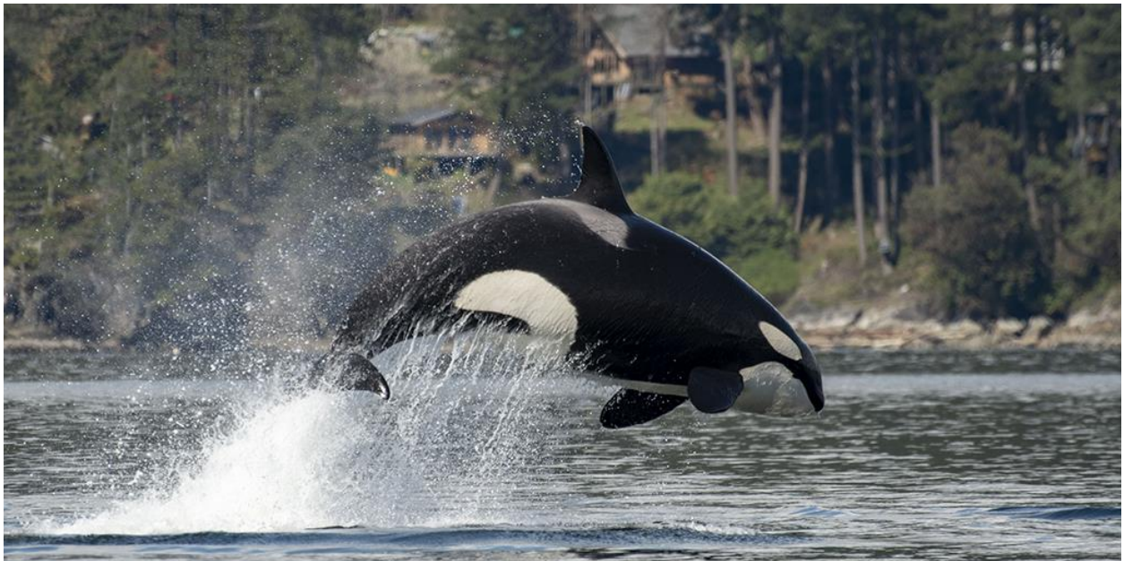
An orca leaps from the water not far from shore.