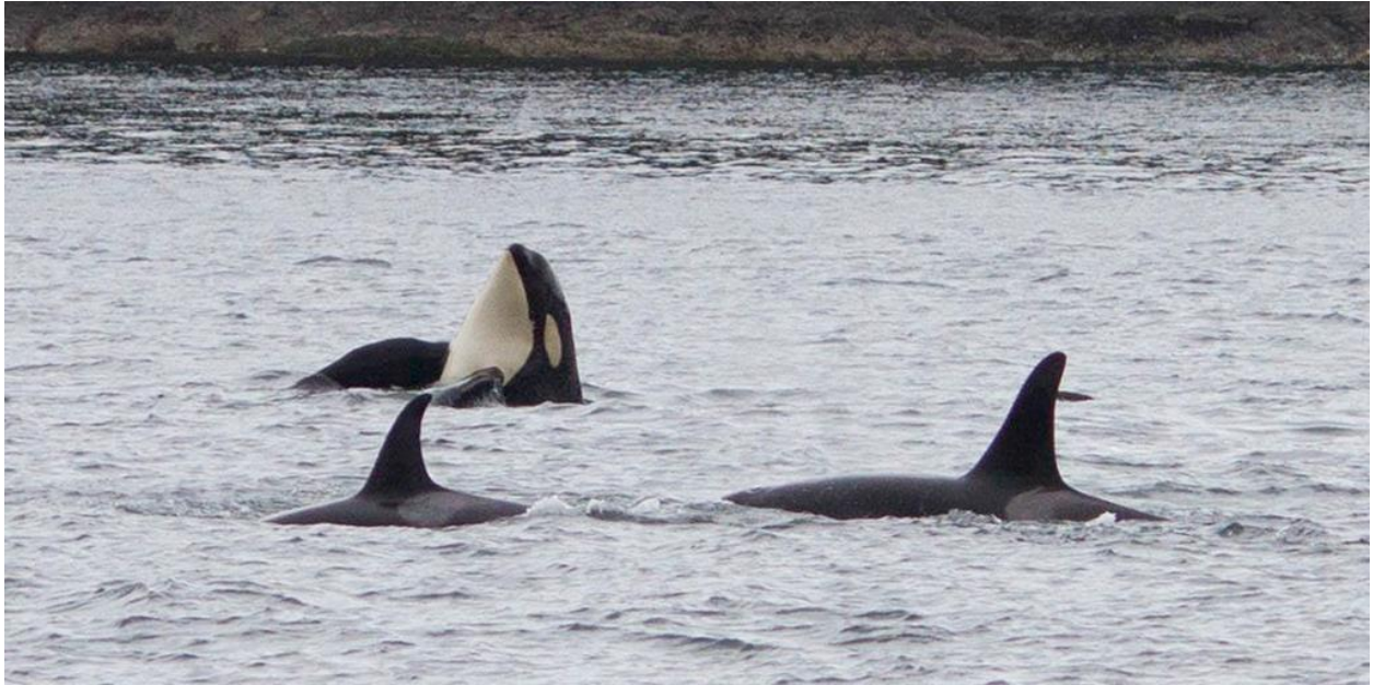
Three southern resident orcas of the family group called J pod hunt fish not far from shore.