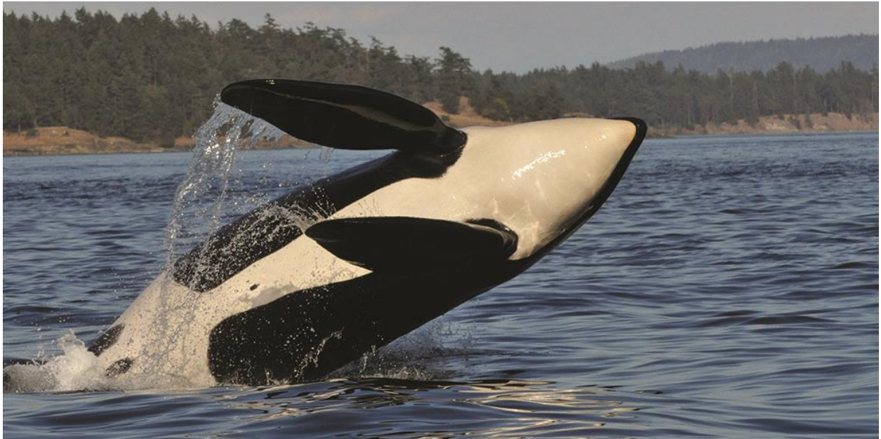
An orca breaches not far from the shore of San Juan Island.